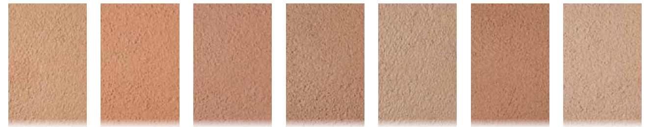
JO-7960R (1 bag) Goldenrod, JO-7960R (2 bags) Goldenrod, BN-2530R (1 bag) Nutmeg, BN-2530R (2 bags) Nutmeg, BN-2531R (1 bag) Potter's Clay, BN-2531R (2 bags) Potter's Clay, JO-4159R (1 bag) Mystic Shadow