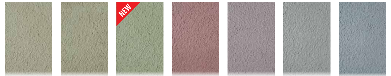
VT-2244R (1 bag) Moss, VT-2244R (2 bags) Moss, VT-2244R (3 bags) Moss, RG-2870IR (2 bags) Desert Red, CB-2580IR (2 bags) Cabernet, CB-2590IR (1 bag) Blue Sea, CB-2590IR (2 bags) Blue Sea