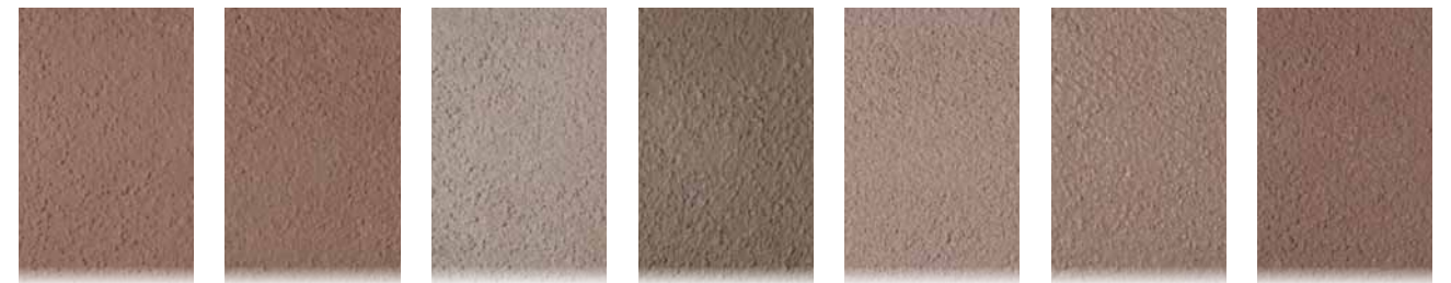
BN-2680R (2 bags) Balsam Wood, BN-2680R (3 bags) Balsam Wood, BN-1616R (1 bag) Plum, BN-1616R (2 bags) Plum, BN-2510R (1 bag) Maple, BN-2510R (2 bags) Maple, BN-2510R (3 bags) Maple