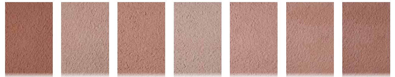
BN-1711R (3 bags) Santa Fe Tan, BN-1714R (1 bag) Santa Fe Tan, BN-1714R (2 bags) Santa Fe Tan, RG-3077R (1 bag) Redwood, RG-3077R (2 bags) Redwood, RG-3072R (1 bag) Maroon, RG-3072R (2 bags) Maroon