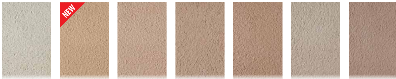
BL-3212R (1 bag) Silver Diamond, JO-7950R (1 bag) Camel, JO-7961R (1 bag) Desert Sand, BN-2739R (1 bag) Stone Castle, BN-2739R (2 bags) Stone Castle, BN-2681R (1 bag) Willow, BN-2680R (1 bag) Balsam Wood