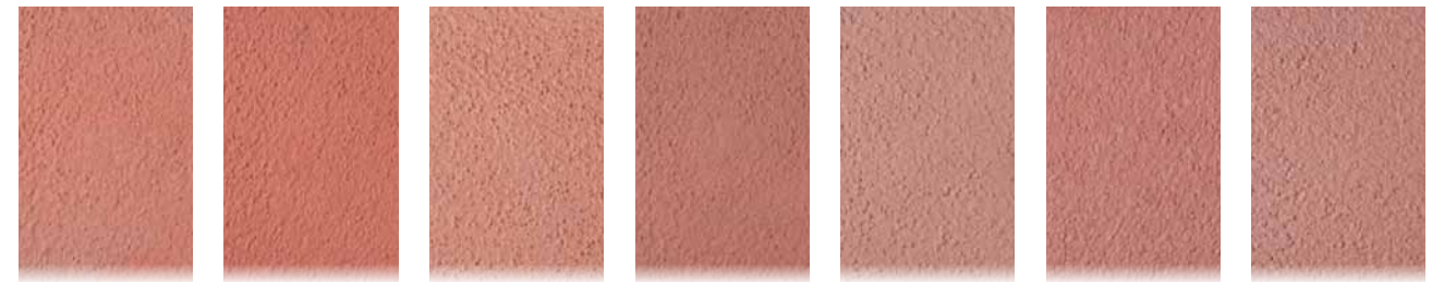
RG-2827R (1 bag) Baja Red, RG-2827R (2 bags) Baja Red, RG-2832R (1 bag) Salmon, RG-2832R (2 bags) Salmon, RG-2835R (1 bag) Egyptian Red, RG-2835R (2 bags) Egyptian Red, RG-2846R (2 bags) Raspberry