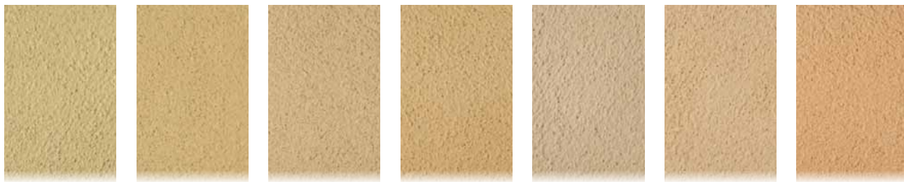
JN-2400R (1 bag) Champagne, JN-2400R (2 bags) Champagne, JN-4010R (1 bag) Gold, JN-4010R (2 bags) Gold, JN-4411R (1 bag) Bamboo, JN-4416R (1 bag) Buff, JN-4416R (2 bags) Buff