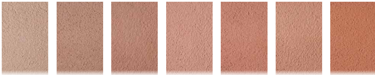
JO-4131R (1 bag) Sahara, BN-1703R (1 bag) Copper, BN-1703R (2 bags) Copper, JO-4134R (1 bag) Orange Blossom, JO-4134R (2 bags) Orange Blossom, JO-6435R (1 bag) Sedona, JO-6435R (2 bags) Sedona