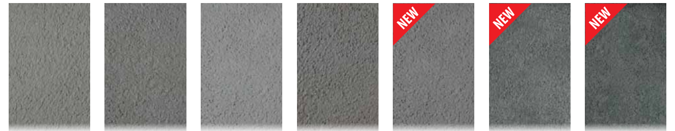
NR-5105R (2 bags) Steel Blue, NR-5105R (3 bags) Steel Blue, NR-5177R (1 bag) Steel Blue, NR-5177R (2 bags) Steel Blue, NR-5790R (1 bag) Black Onyx, NR-5790R (2 bags) Black Onyx, NR-5790R (3 bags) Black Onyx