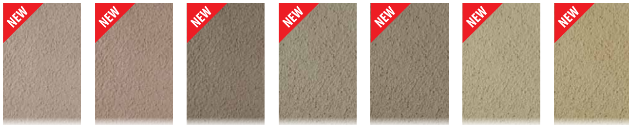
BN-2730R (1 bag) Biscuit, BN-2978R (1 bag) Chocolate Fudge, BN-2978R (2 bags) Chocolate Fudge, BN-2550R (1 bag) Khaki, BN-2550R (2 bags) Khaki, VT-3450R (1 bag) Olive, VT-3450R (2 bags) Olive