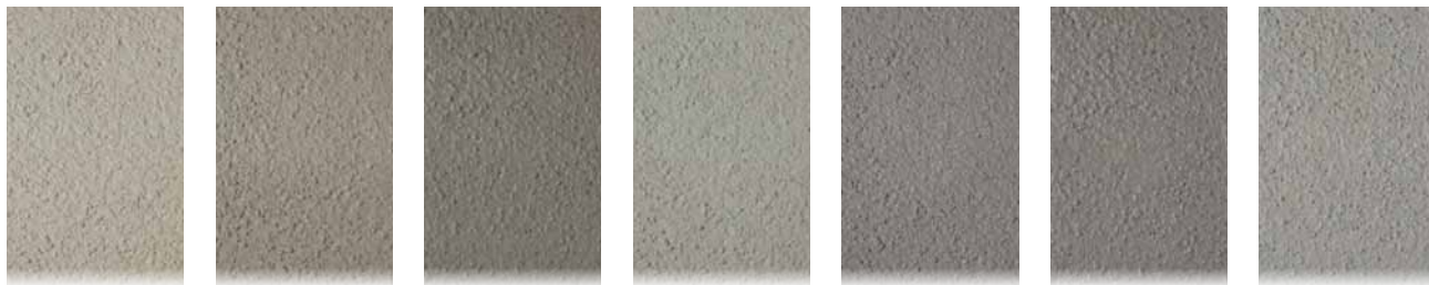
NR-5011R (1 bag) Shadow Gray, NR-5010R (1 bag) Gray Cloud, NR-5010R (2 bags) Gray Cloud, NR-5171R (1 bag) Midnight Bay, NR-5157R (1 bag) Monsoon, NR-5157R (2 bags) Monsoon, NR-5105R (1 bag) Smoke